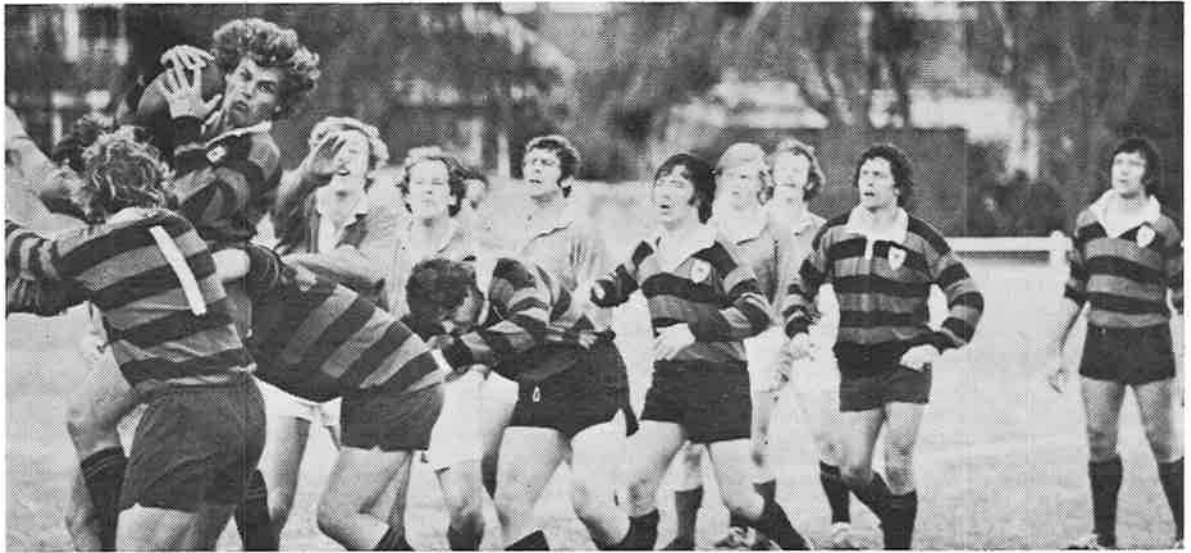
ALRIGHT . . . BUT DON'T GIVE IT TO THE BACKS