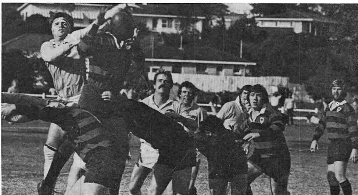
HANDS ON HEADS MOOSH