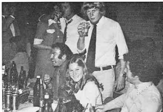
THE BOYS DRINK ON AS BLOOD REACHES FOR ANOTHER