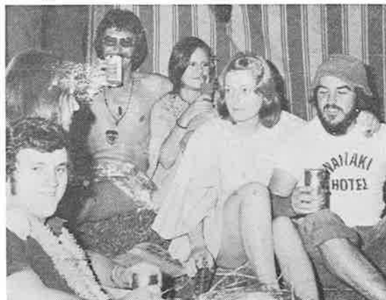
HOW ABOUT A ROLL IN THE HAY?