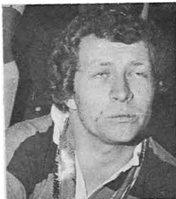
"BLOW IN WHAT BAG, OFFICER."