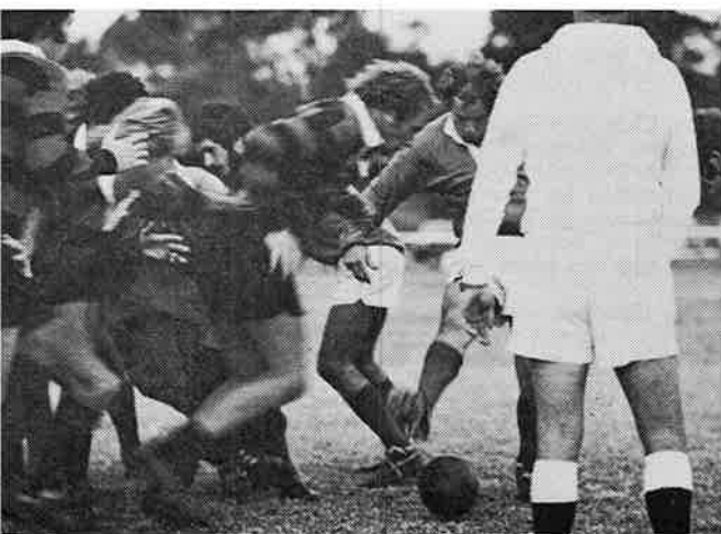
"IT'S MINE, ALICE! IT'S MINE!"