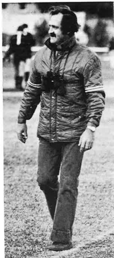
THERE IS NO SUCH THING AS RETIREMENT, 'DOC'.