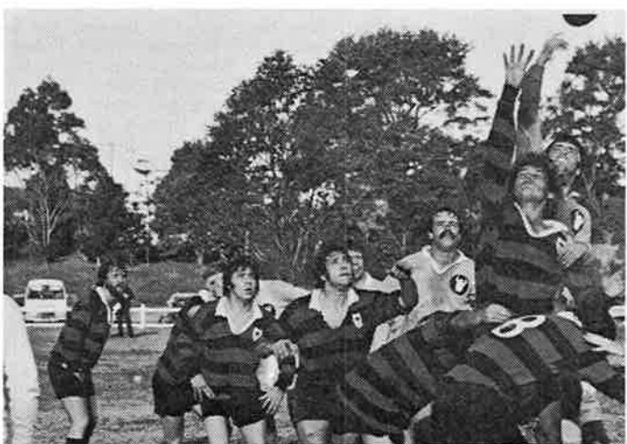
A CAPTAIN'S VIEW