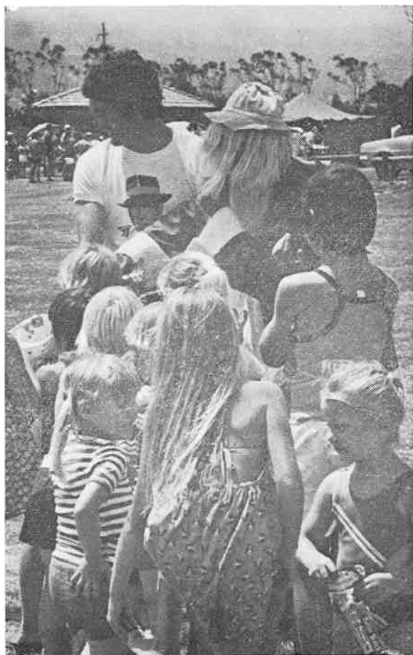
SANTA SPENT CHRISTMAS ON NORTH BEACH