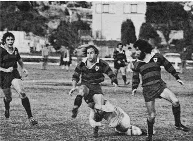
HOW MANY MAKE AN OVERLAP