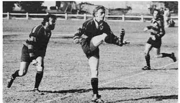
JUST BECAUSE I DO IT . . .