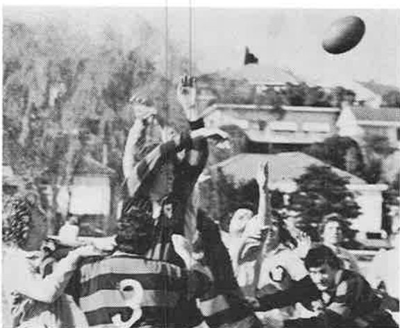
A CLEAN TAP BACK TO THE FULL BACK