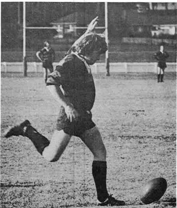
WHAT ABOUT THE GOAL POSTS STEELY?