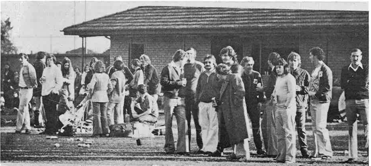
THE FANS WENT WILD