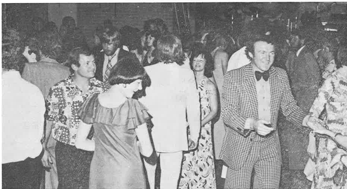
??? A SCENE FROM THE ANNUAL BALL OR A BARBECUE AT WEST STREET?