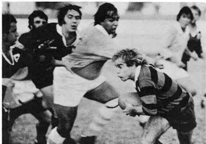
ROUND ONE TO SMITHY