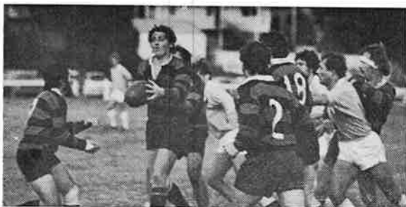
THIS WHAT YOU'RE LOOKING FOR?