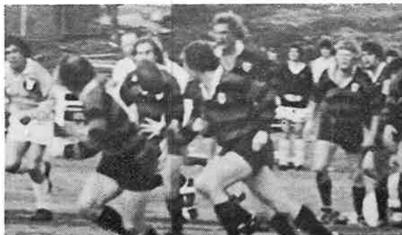
ANOTHER WARATAHS ONSLAUGHT