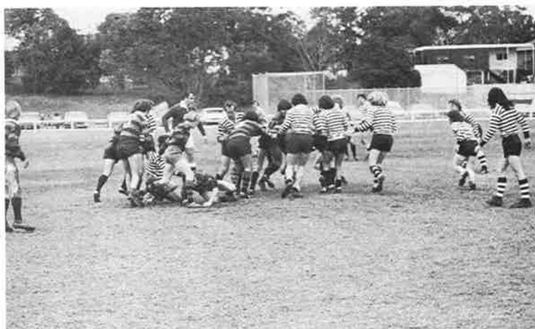
Waratahs on the move