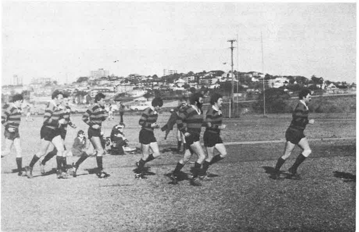
1st Grade runs on against Bowral