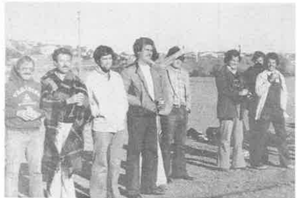
The fans brave the elements