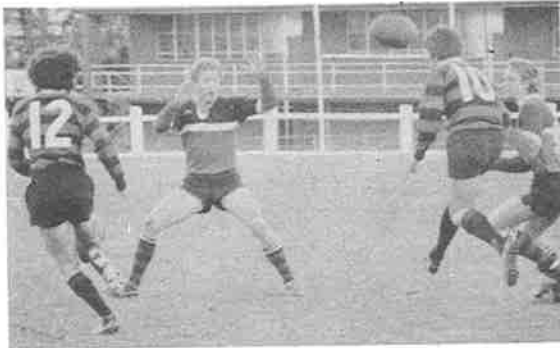
Plonky kicks ahead