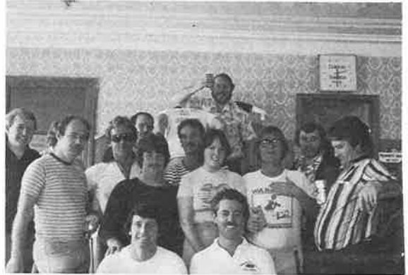
The happy crew in the Pub at Parkes.

Summing up I think we could say that this has been a successful social season and there are still more events coming up, so stay in touch at the Oxford Hotel.