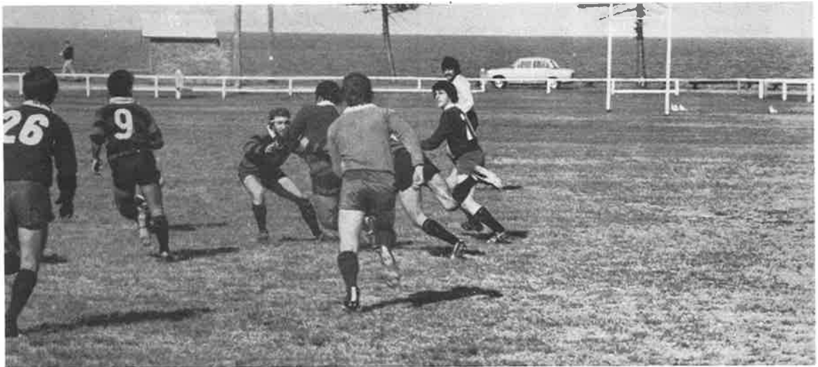
2nd Grade backs halt another 'Rocks attack.