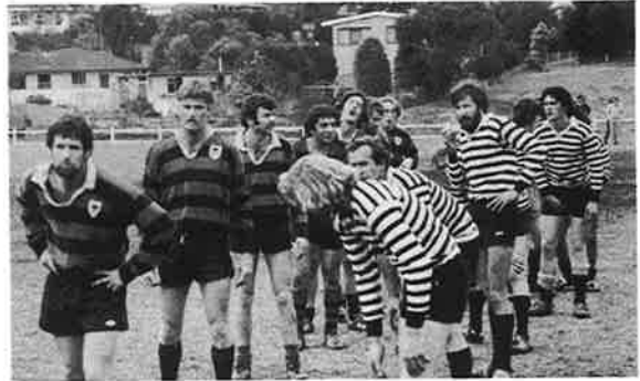
The towering 3rd Grade lineout