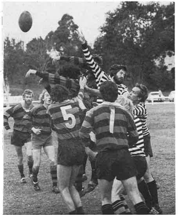
A 3rd Grade lineout win