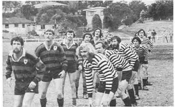
A picture of concentration