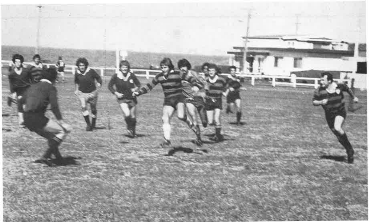
On the move at Nicho Park.