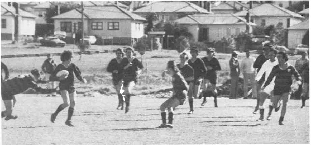
2nd Grade defending.