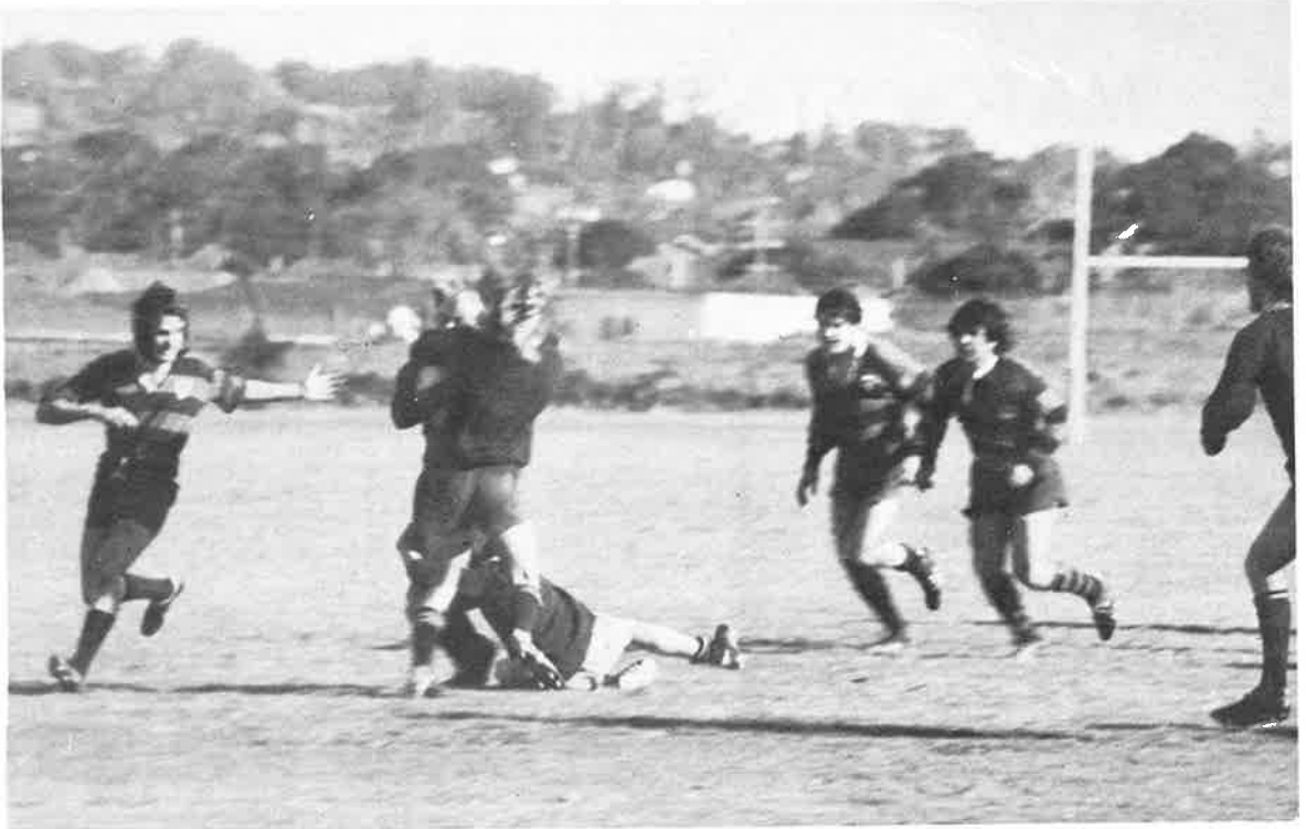
Give it! Give it!