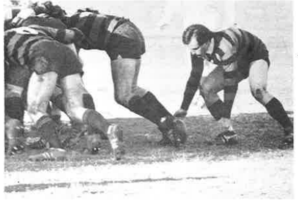
Clean ball for Silvs