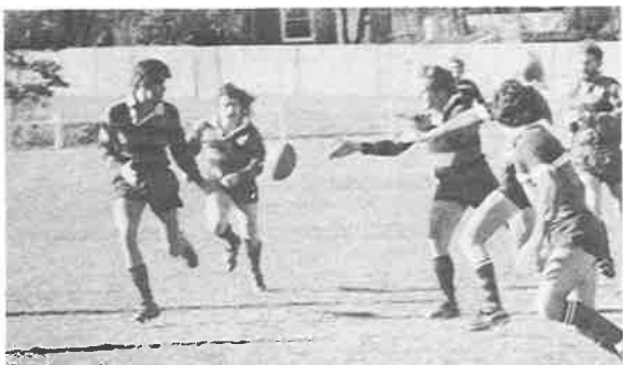
Quick hands through the 2nd Grade backs