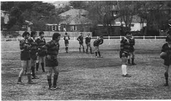
The forwards have had it.