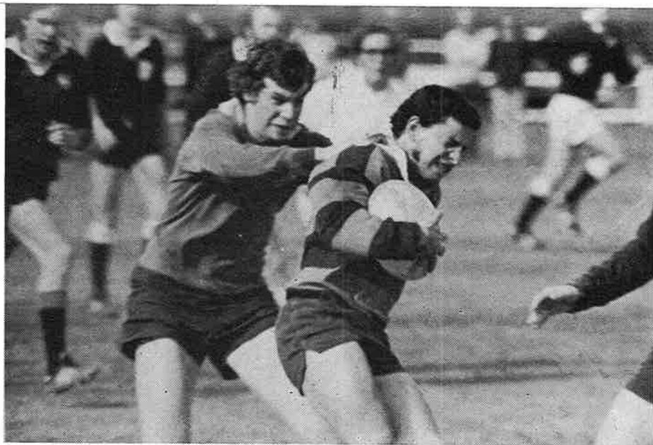
ABOVE: Is there