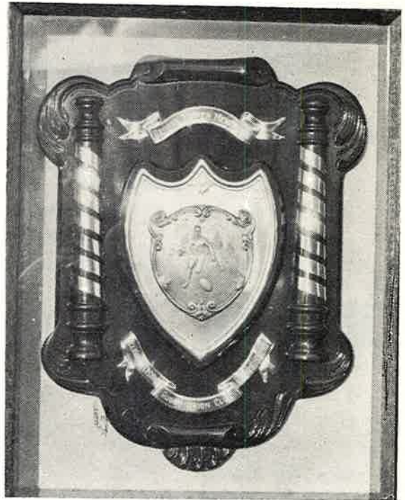
George Tipper Memorial Shield