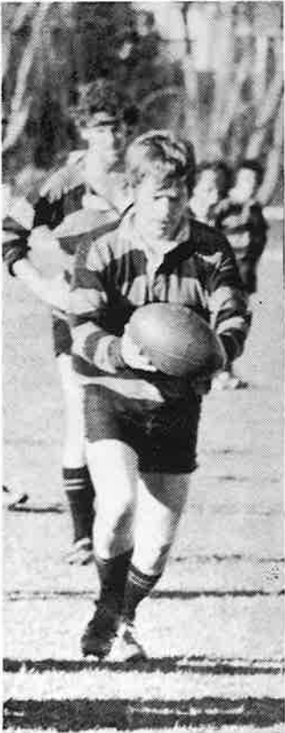
ABOVE: Forwards are not supposed to kick.